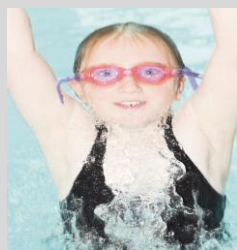
Our swimmers celebrate their achievement – photographs courtesy of The Windsor Express