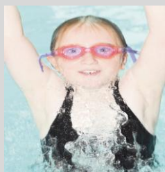
Our wonderful Swimathon swimmers.